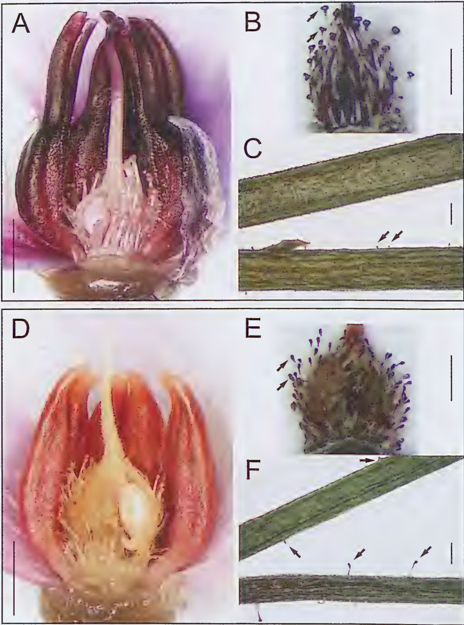
Figure 3. Comparative morphology of Tetratheca sparteae (A–C; R. Butcher, F. Hort & J. Hort RB 1179) and T. nuda (D–F; R. Butcher, F. Hort & J. Hort RB 1189). A – dissected rehydrated flower showing elongate anther tubes, ±globular-headed glandular hairs on the ovary and glabrous style; B – dried ovary showing ±discoid-headed glandular hairs (arrowed); C – mature (upper) and young (lower) stems showing papillae and minute glandular hairs (arrowed); D – dissected rehydrated flower showing short anther tubes and orifices with elongate lower lip, ovary with both simple and glandular hairs and pubescent style base; E – dried ovary showing ±ellipsoid-headed glandular hairs (arrowed); F – mature (upper) and young (lower) stems showing longer glandular hairs and remnant bases (arrowed). Scale = 1 mm (A, D); 0.5 mm (B, C, E, F).